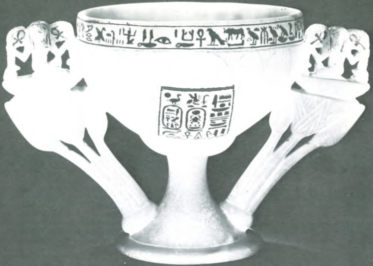
Alabaster chalice, decorated with blue pigment, represents a single bloom of the white lotus. Each handle support consists of a single flower of the blue lily and two buds. The handles are composed of figures of Heh, the god of eternity. The inscription to Tutankhamun reads: "May you spend millions of years, you who love Thebes, sitting with your face to the north wind, your two eyes beholding happiness."

Orchestrated sequences of spaces and controlled vistas are other virtues of the Gallery's installation. They are especially effective in the treasury section which leads to another exhibition highlight, the gilded goddess Selket. Again, a giant photomural leads the visitor into four rectilinear, deep blue rooms set on an axis culminating with Selket. Carter's words give his feelings on entering the treasury, "When for the first time, one enters a room such as this, the sanctity of which has been inviolate for more than thirty centuries, a sense of reverence, if not fear, is felt on the part of the intruder."