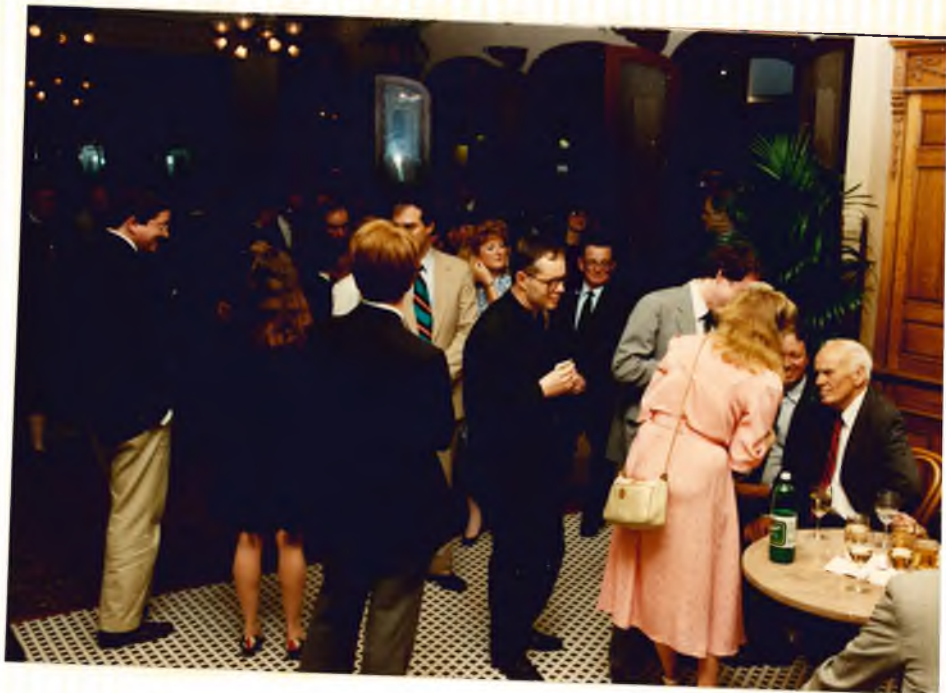
FOND ADMIRERS OF WALKER PERCY WENT OVER TO HIS TABLE THROUGHOUT THE RECEPTION TO SAY HELLO