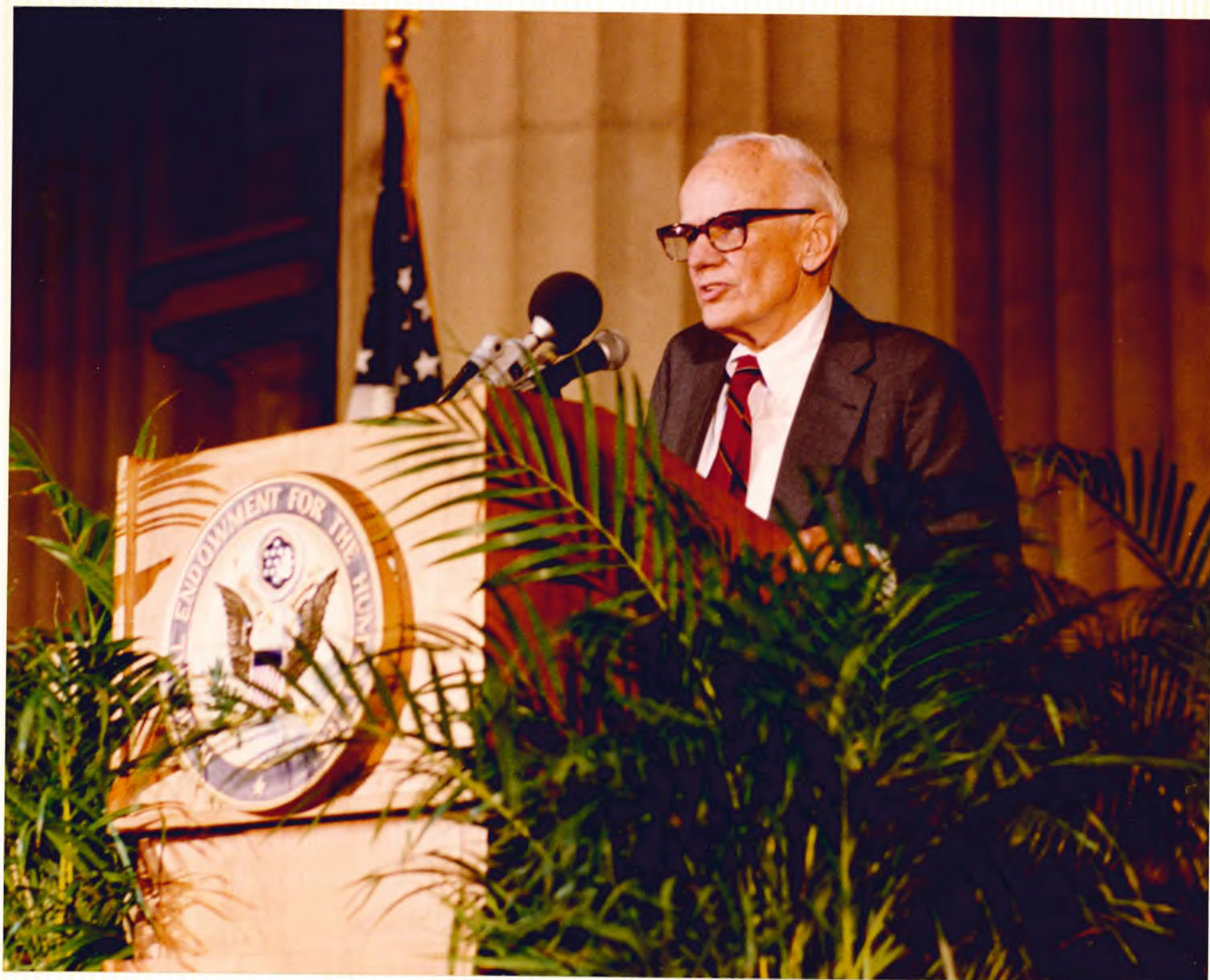
WALKER PERCY, EIGHTEENTH JEFFERSON LECTURER, AT THE PODIUM PRESENTING HIS LECTURE, "THE FATEFUL RIFT: THE SAN ANDREAS FAULT IN THE MODERN MIND", TO AUDIENCE