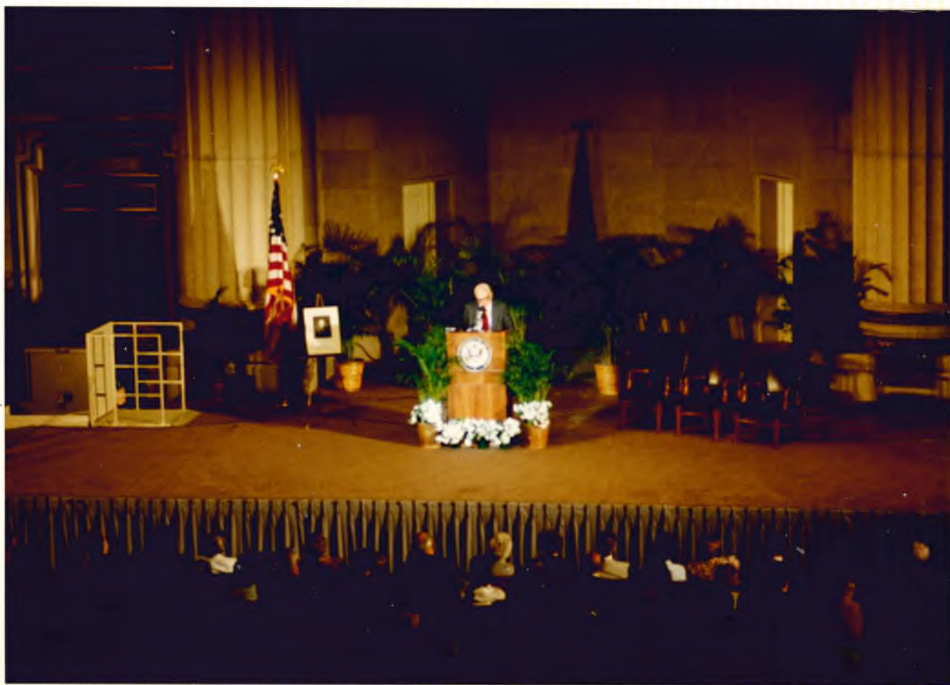
AUDIENCE LISTENS AS WALKER PERCY DELIVERS EIGHTEENTH JEFFERSON LECTURE AT THE DEPARTMENTAL AUDITORIUM