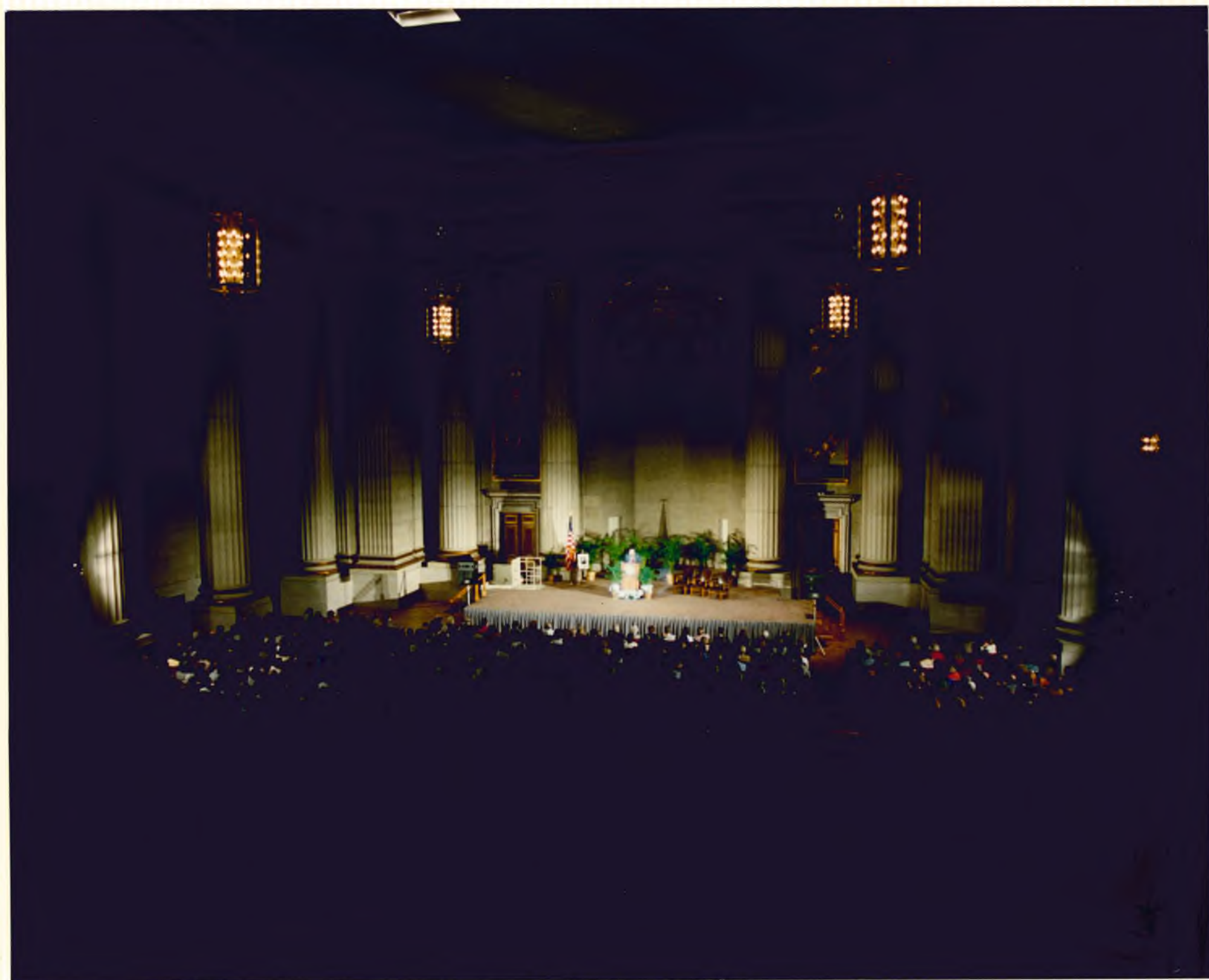
WALKER PERCY ON STAGE AT THE DEPARTMENTAL AUDITORIUM DURING 1989 JEFFERSON LECTURE IN THE HUMANITIES