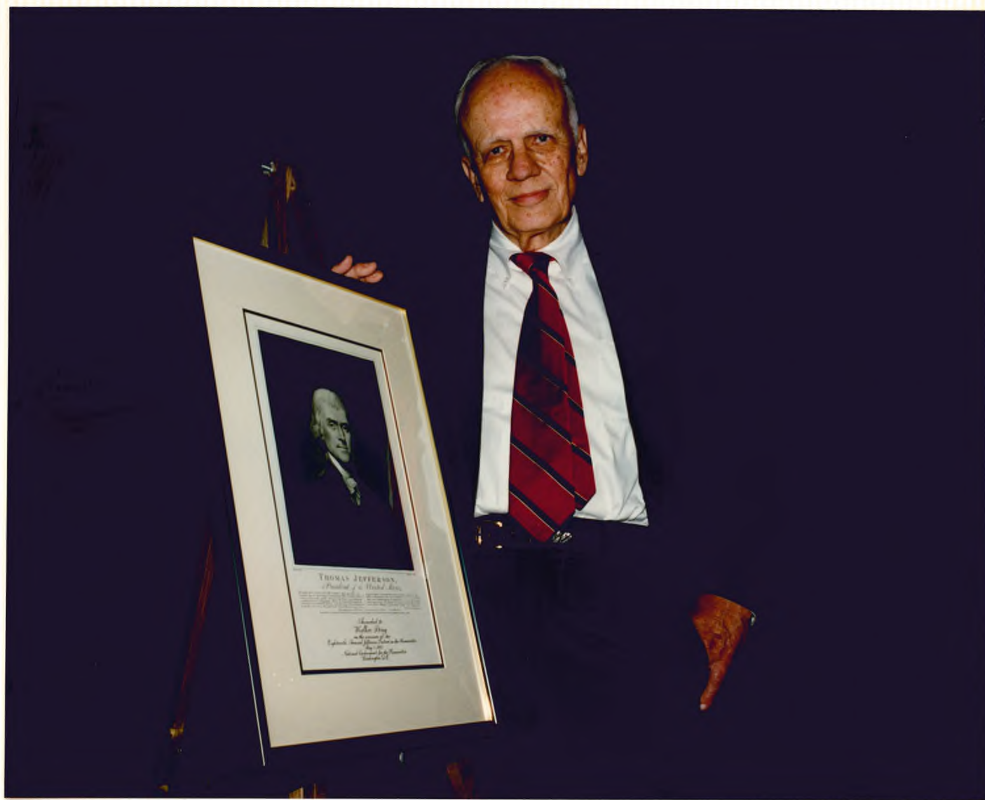
WALKER PERCY, EIGHTEENTH JEFFERSON LECTURER, POSES WITH JEFFERSON ENGRAVING.