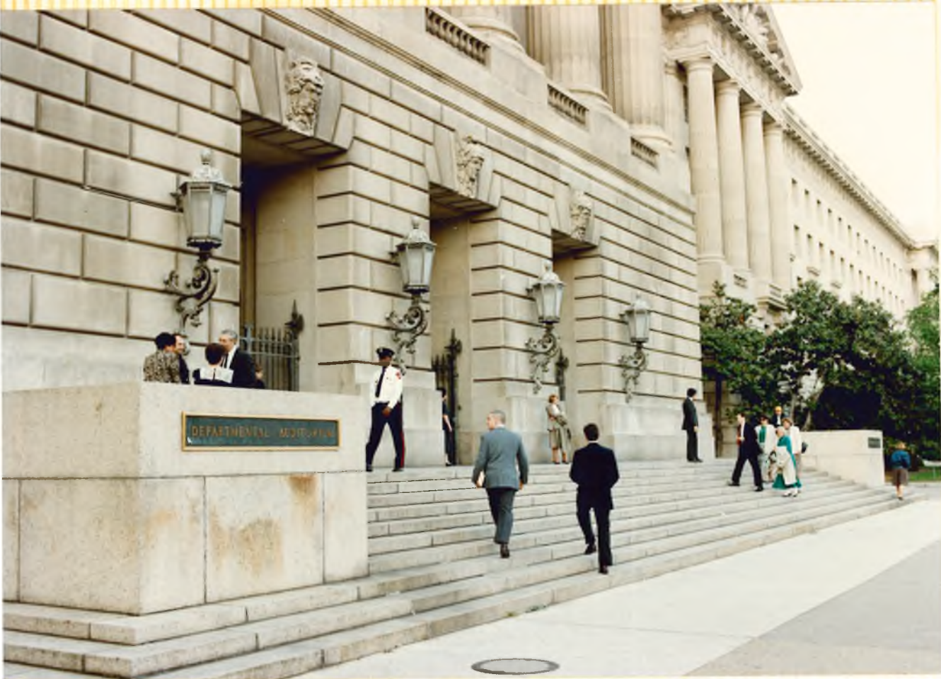
THE DEPARTMENTAL AUDITORIUM SITE-- OF THE 1989 JEFFERSON LECTURE