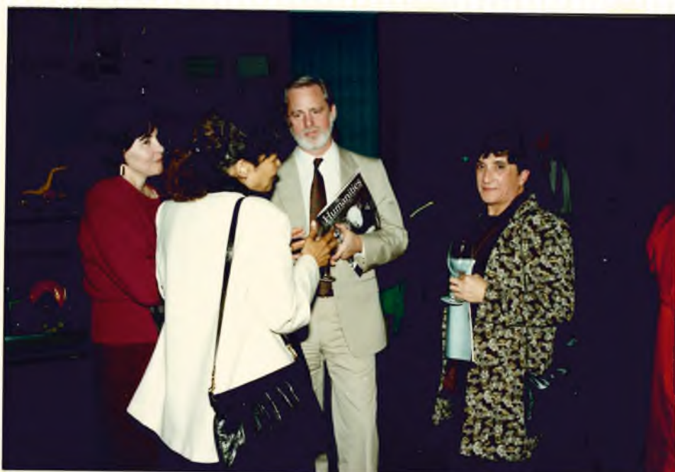
DC HUMANITIES CHAIRMAN WITH GUESTS AT RECEPTION