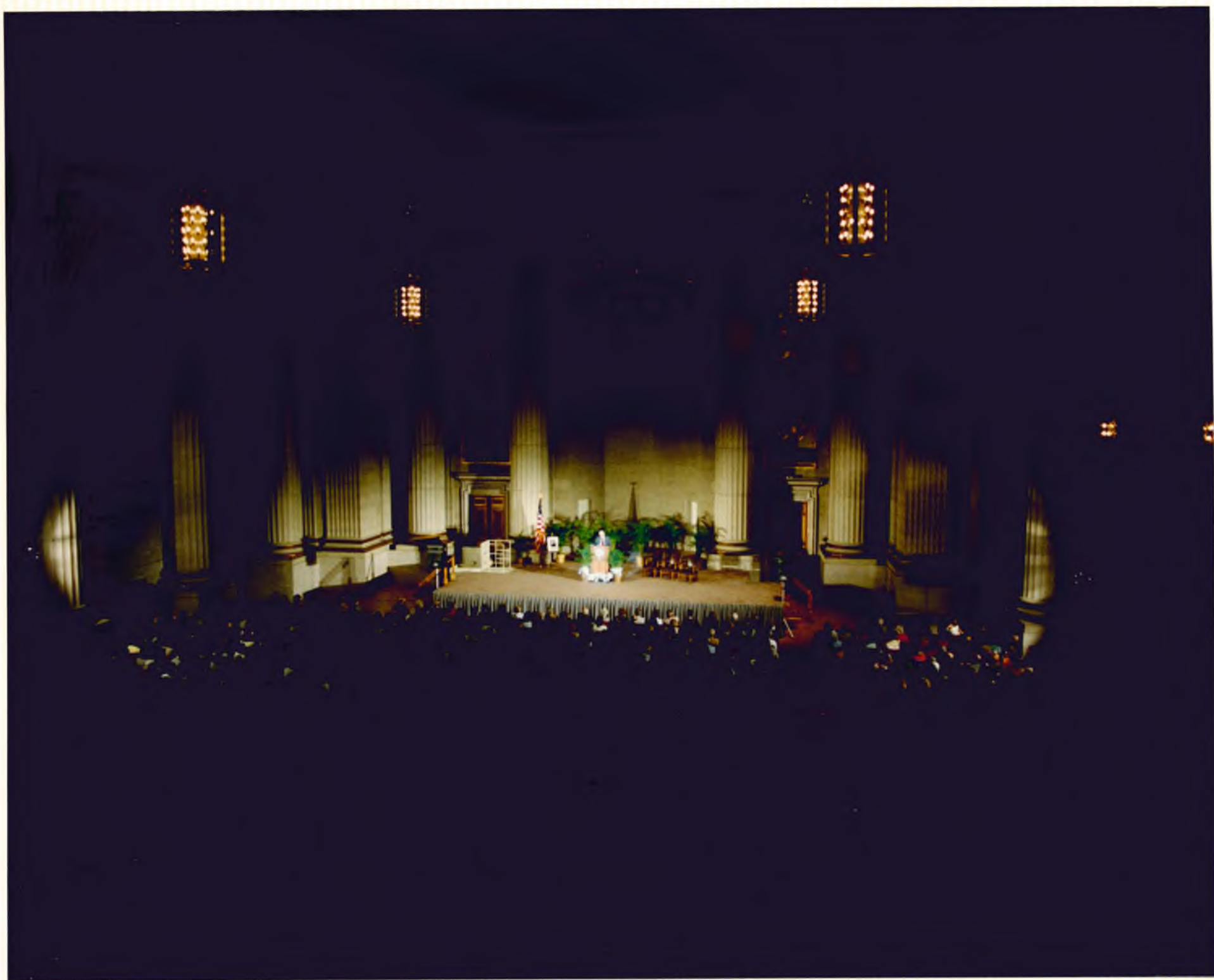
WALKER PERCY ON STAGE AT THE DEPARTMENTAL AUDITORIUM DURING 1989 JEFFERSON LECTURE IN THE HUMANITIES