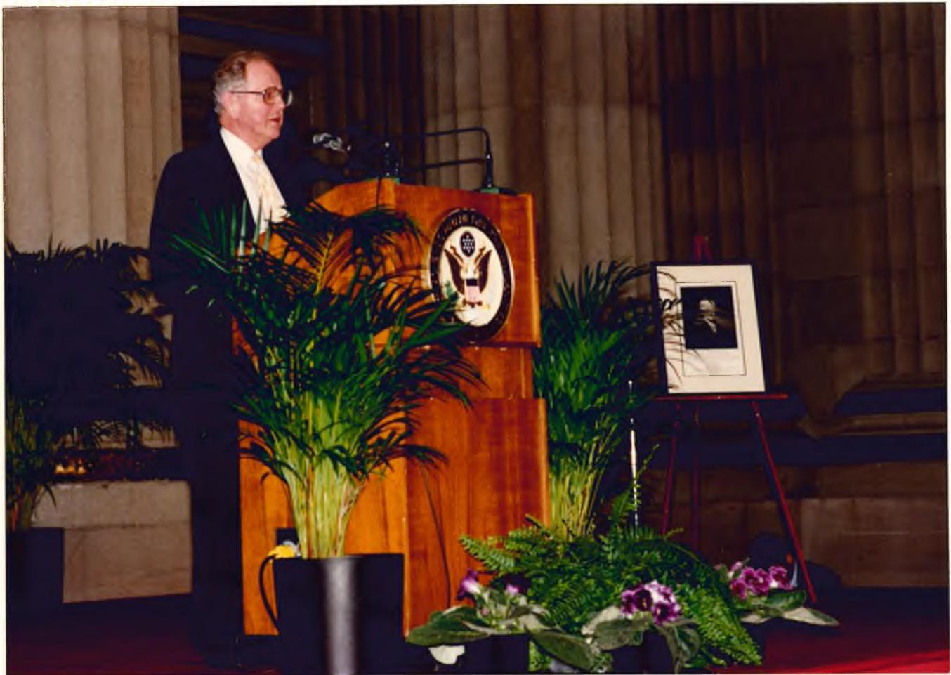
Dr. Robert Conquest, the 22nd Jefferson Lecturer, delivers his lecture, "History, Humanity and Truth", at the Andrew W. Mellon auditorium.