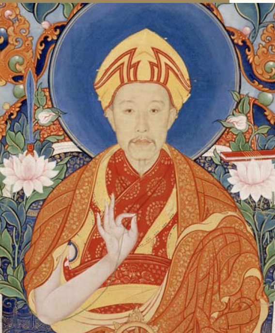
Detail of the Portrait of the Qianlong Emperor as the Bodhisattva Manjusri from the Asian Art Digital Teaching Project at Columbia University.

Institutional Grants enrich the humanities at the nation's historically black, Hispanic-serving, and tribal colleges and universities by increasing their teaching and research capacities. An award to Clark Atlanta University enabled the historically black university to conduct a series of activities that incorporated