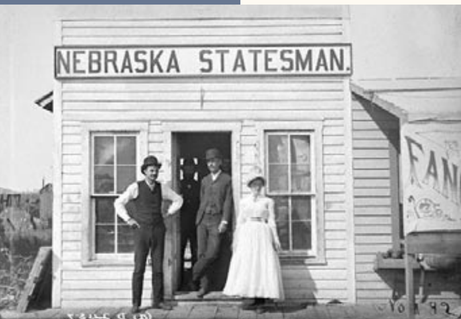
The Nebraska Statesman newspaper office in Broken Bow, is preserved as part of the United States Newspaper Program.

electoral returns from 1788 to 1825, featuring information on presidential, congressional, gubernatorial, and state executive and legislative elections. An award to the National Preservation Program for Agricultural Literature at Cornell University helped to microfilm thousands of deteriorating volumes of agricultural reports from Colorado, Maryland, Oklahoma, and Washington State. With NEH support, the Southeastern Library Network in Atlanta supports workshops, publications, and other educational programs for hundreds of public, college, and