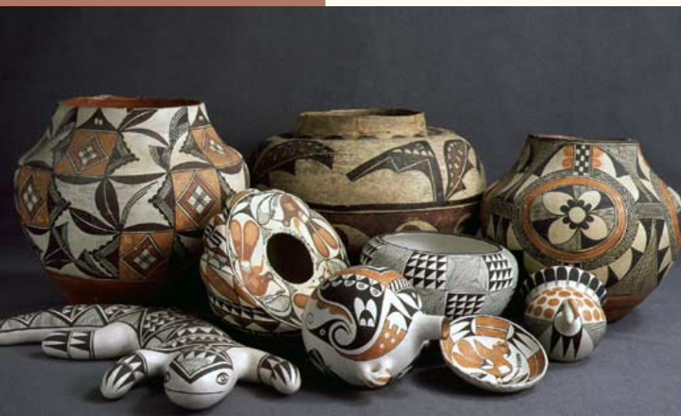
Acoma pots from Arizona State Museum's collections have new climate-controlled storage and a conservation lab.

endow programs of visiting scholars, lectures, conferences, and special projects in the humanities that will play a significant role in American intellectual scholarship and culture. The Philadelphia Museum of Art used the renovation of a nearby building as an opportunity to develop new interpretive plans for its collections. To enrich the humanities content of the reinstalled holdings and related programming, the museum received this year $708,150 of its $800,000 challenge grant to endow the position of senior curator of education and the humanities programming that person oversees.