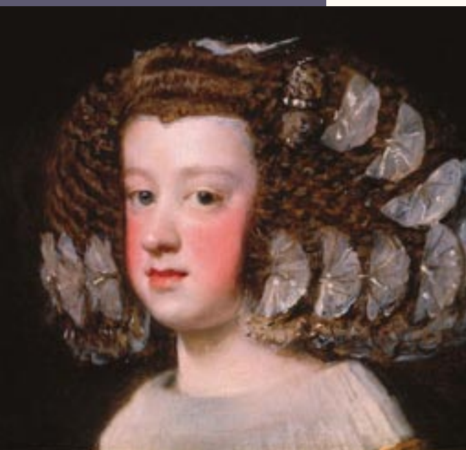
Velázquez's Maria Teresa Infanta of Spain is part of the NEH exhibition "Spain in the Age of Exploration."

Through the Division of Public Programs, NEH opens new vistas on culture and learning to Americans through exhibitions and catalogs, radio and television programs, reading and film discussions, symposia, conferences, and interactive multimedia projects. In fiscal year 2004, exhibitions in the nation's museums and historic sites covered a range of topics, such as the impact of the Quonset hut on the culture of post-World War II Alaska; the origins and development of the institution of kingship among the Maya; and the reinterpretation of Andrew Jackson's home, The Hermitage; and the history of early twentieth-century American art. The Seattle Art Museum received an NEH grant for Spain in the Age of Exploration: 1492–1819 . It included more than one hundred major works of art and science, drawn mostly from the Spanish royal collections. This exhibition, along with its catalog and public programs, traces changing attitudes toward knowledge, exploration, and faith during Spain's Golden Age.