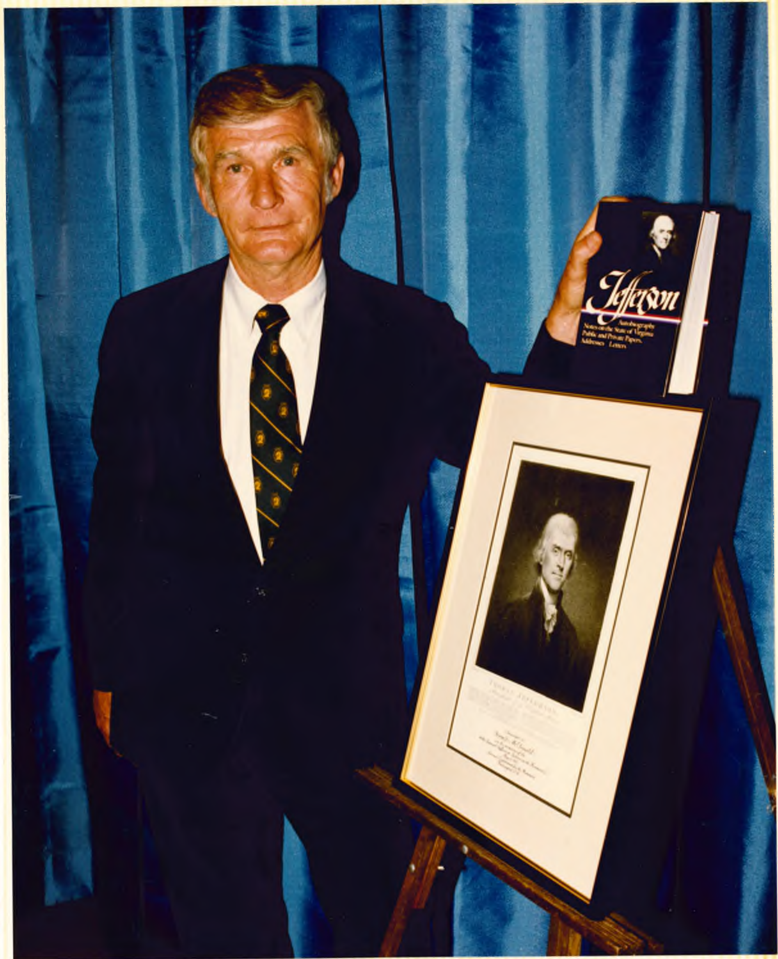
Forrest McDonald Sixteenth Jefferson Lecturer