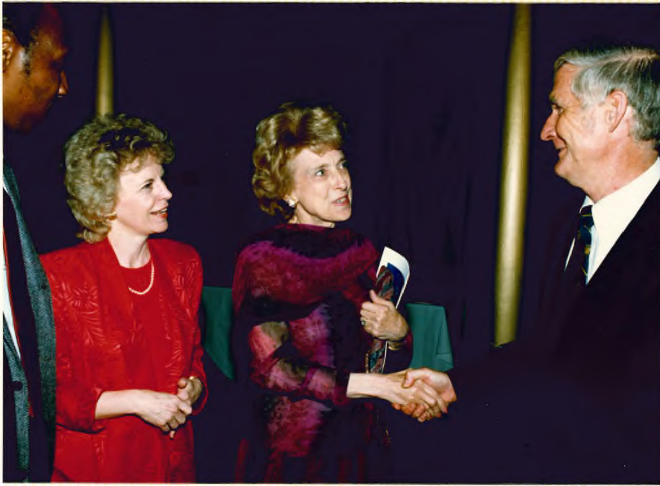
Lindy Boggs congratulating Forrest McDonald with Lynne Cheney