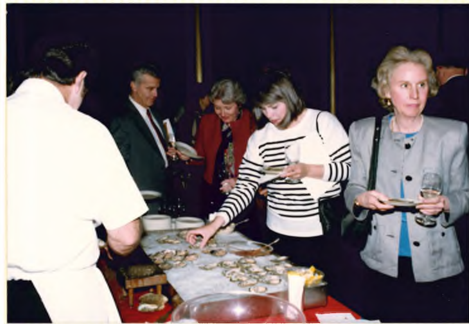
Guests enjoy reception