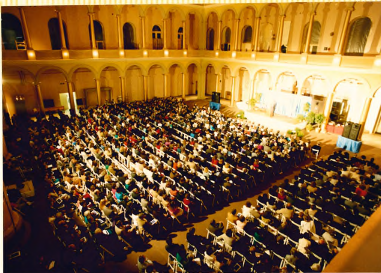
Audience in Great Hall of National Building Museum at Sixteenth Jefferson Lecture