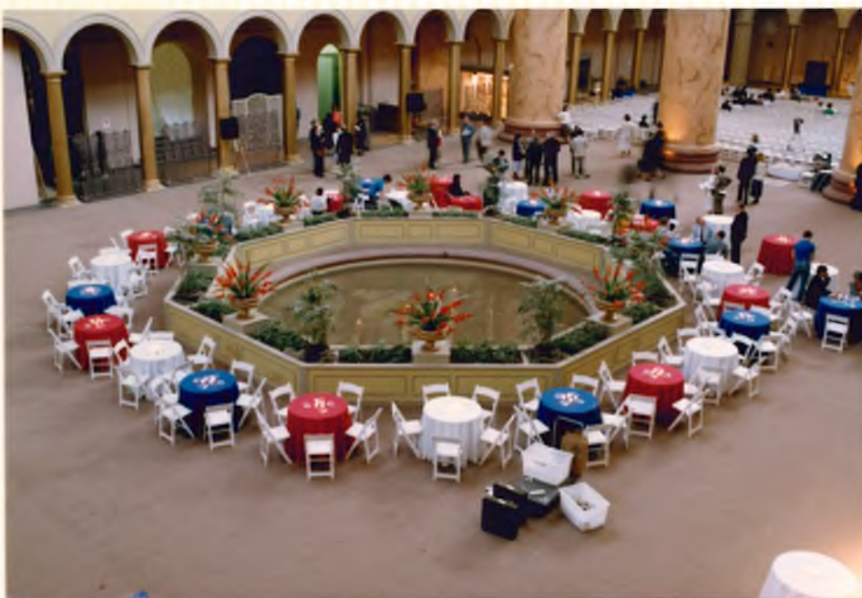
Great Hall ready for lecture and reception