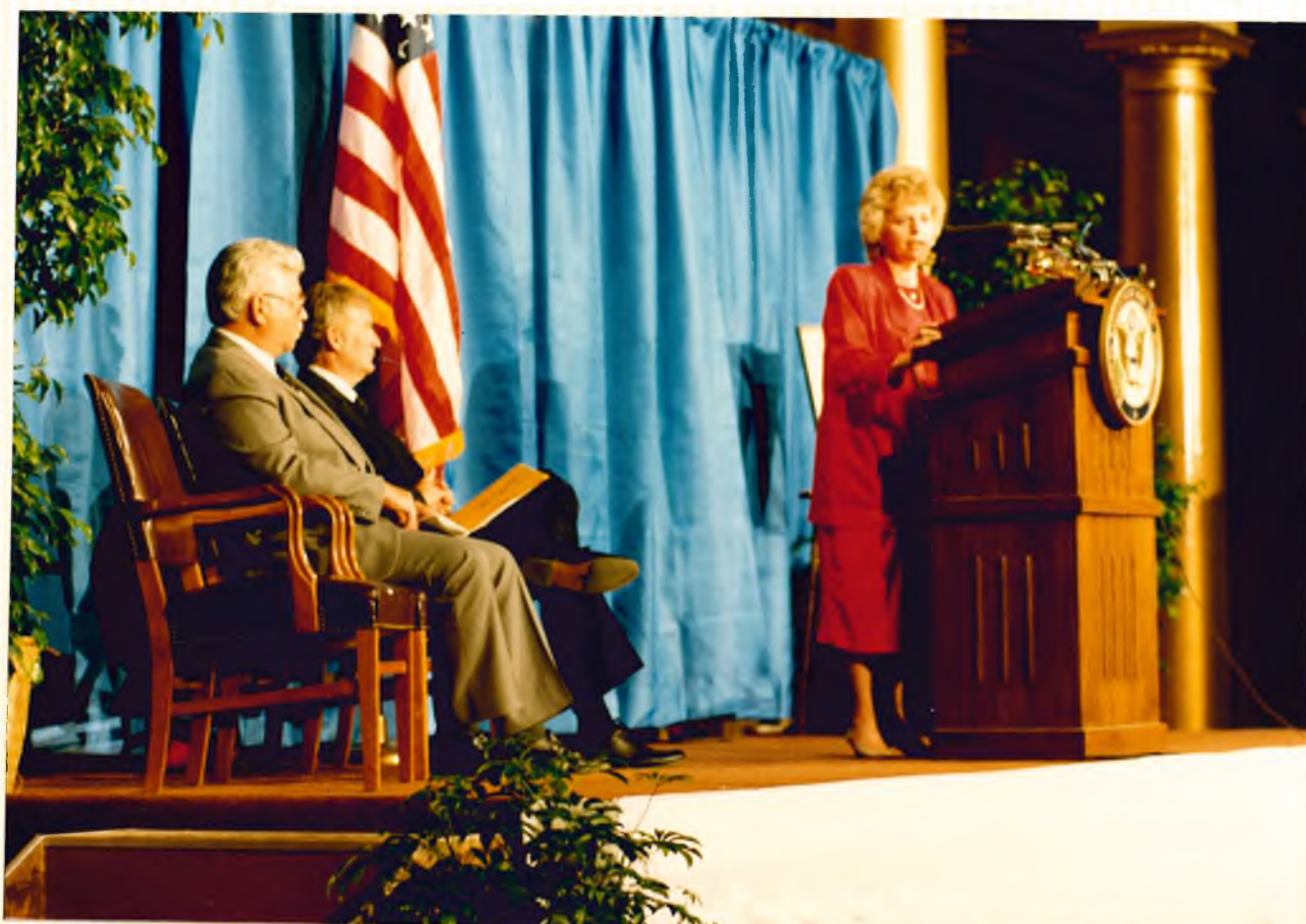
Lynne Cheney delivering opening remarks