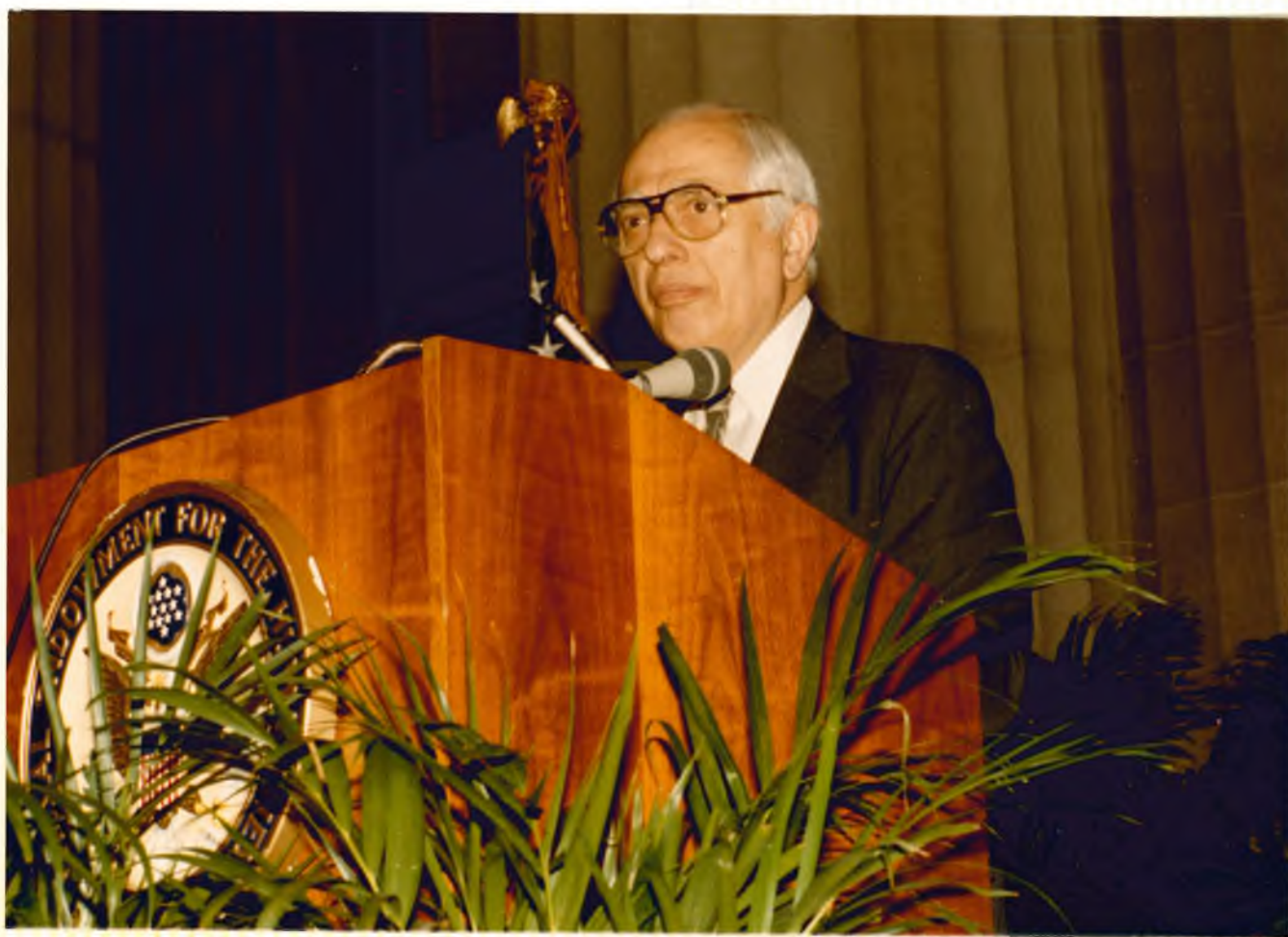
Dr. Bernard Lewis, 19th Jefferson Lecturer in the Department of Humanities, presenting his lecture, "Western Civilization: A View from the East."