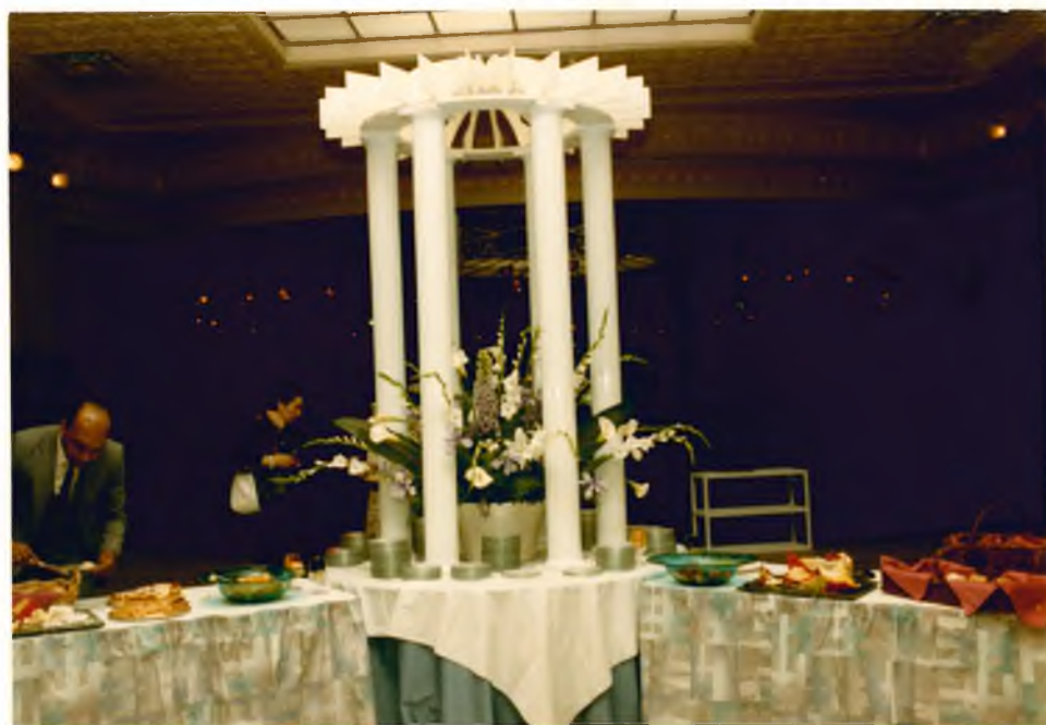
Floral display at the reception following the lecture, National Museum of American History.