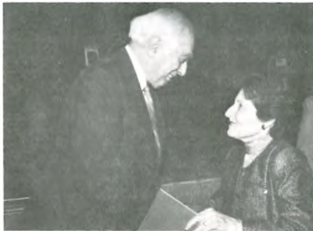
Jefferson Lecturer Bernard Lewis receives congratulations from former NEH Council Member Gertrude Himmelfarb after the Washington lecture.

Currently in the midst of its centennial celebration, Stanford University has among its 1,315 faculty members nine Nobel laureates