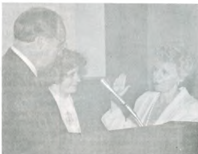
Chairman Lynne V. Cheney at her swearing-in ceremony with her husband Dick Cheney, the Secretary of Defense, and their daughter Elizabeth.

century, as well as a major scholarly press. In addition to Stanford students, faculty, and resident scholars, users of the library and archives include scholars from throughout the United States and other nations who come to conduct research in the area collections on Africa, the Middle East, East Asia, Russia, Latin America, North America, and Eastern and Western Europe.