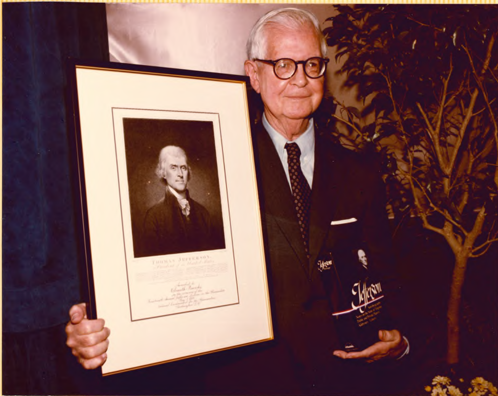
CLEANTH BROOKS 1985 JEFFERSON LECTURER