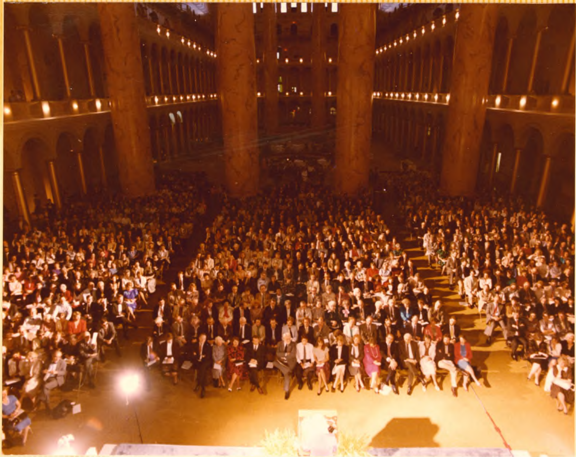
THE PENSION BUILDING JUDICIARY SQUARE MAY 8, 1985